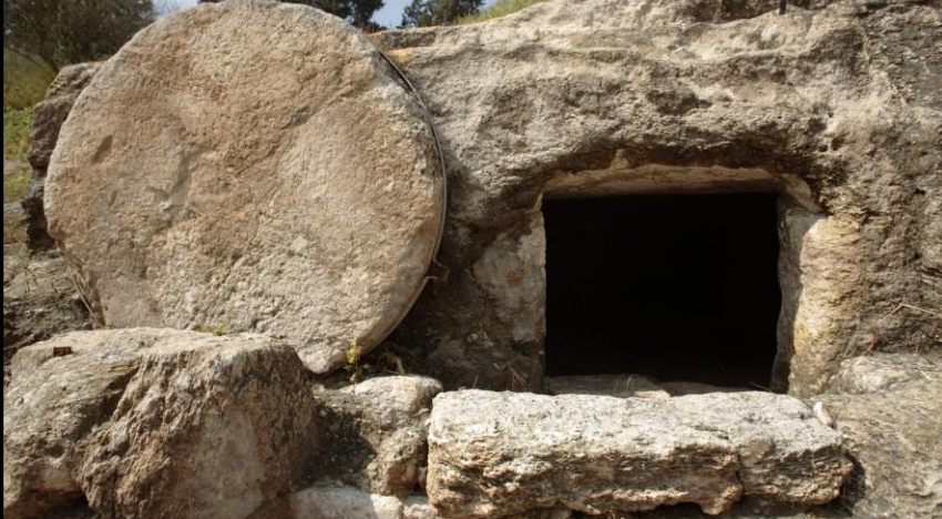
This is what Jesus' tomb may have looked like. Can you see the big stone that was rolled across?