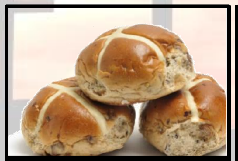
A hot cross bun is a sweet, spiced bun. It is made with dough and raisins and has a cross on top. The cross represents the crucifixion of Jesus and the spices signify the spices used on his body.