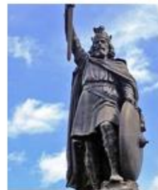
Alfred the Great 886-889