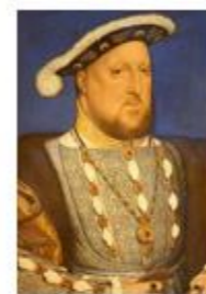
Henry VIII 1509-1547