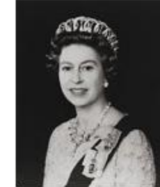
Elizabeth II 1952-Pesent