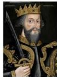
William the Conqueror 1066-1087