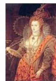
Elizabeth I 1558-1603