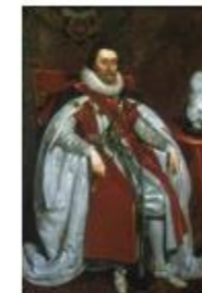
James I 1603-1625